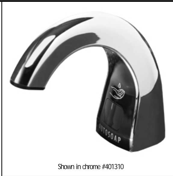
Shown in chrome #401310

Case Pack: 4 Case Weight: 12 lbs. Case Cube: 1.15 Case Pack: 4 Case Weight: 10 lbs. Case Cube: 1.15